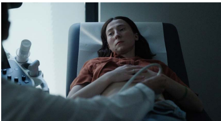
Film still The Good Woman , Masha Mollenhauer

Audience Award 2026: The Good Woman , by Masha Mollenhauer